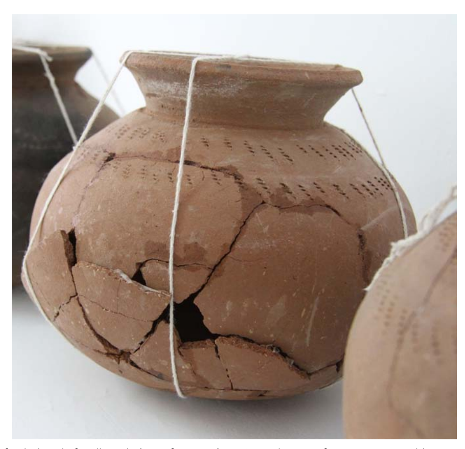
Amy Lee Sanford, detail of Full Circle (Arc of Six Pots) , 2012-15, clay pots from Kampong Chhnang with glue and cotton string, dimensions variable