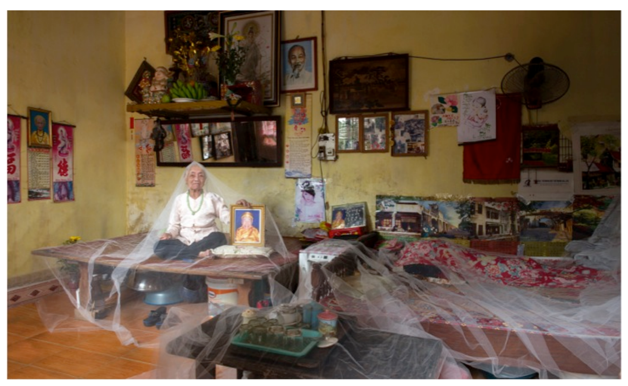
Phan Quang, Native Country, 2013, Digital C Print on aluminium, 90 x 150cm